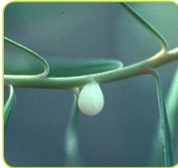
Latex is found in all plant parts

Leafy spurge was once the most difficult noxious weed to control in North Dakota and infests all 53 counties. Scientists at the North Dakota Agricultural College (NDAC) recognized leafy spurge could be a problem soon after it was first identified in the state, growing along a Fargo street in 1909. However, the plant was not added to the state noxious weed list until 1935, when leafy spurge was found growing in all but 10 counties. The largest single infestation at that time was estimated to be 193 acres in Foster County.