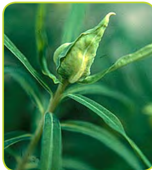
Leafy spurge gall